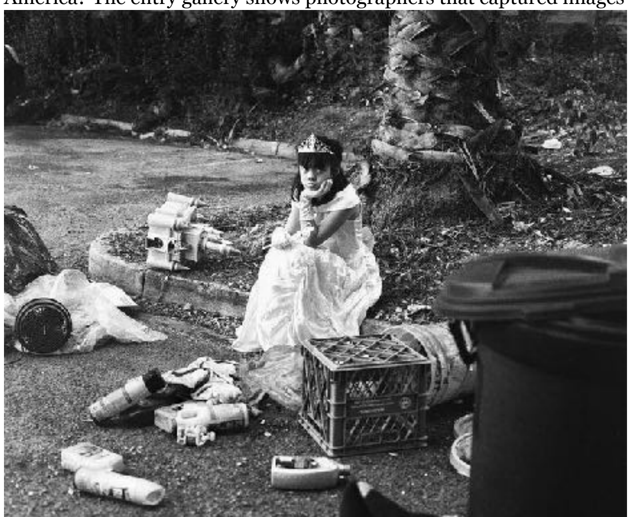
Norman Aragones' photograph "Growing Up" awarded Honorable Mention in Photowork 2021.

Sands included photographs that reflected on the question, what is America? The entry gallery shows photographers that captured images